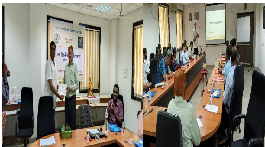
Hindi workshop organisation 29 th April-2024