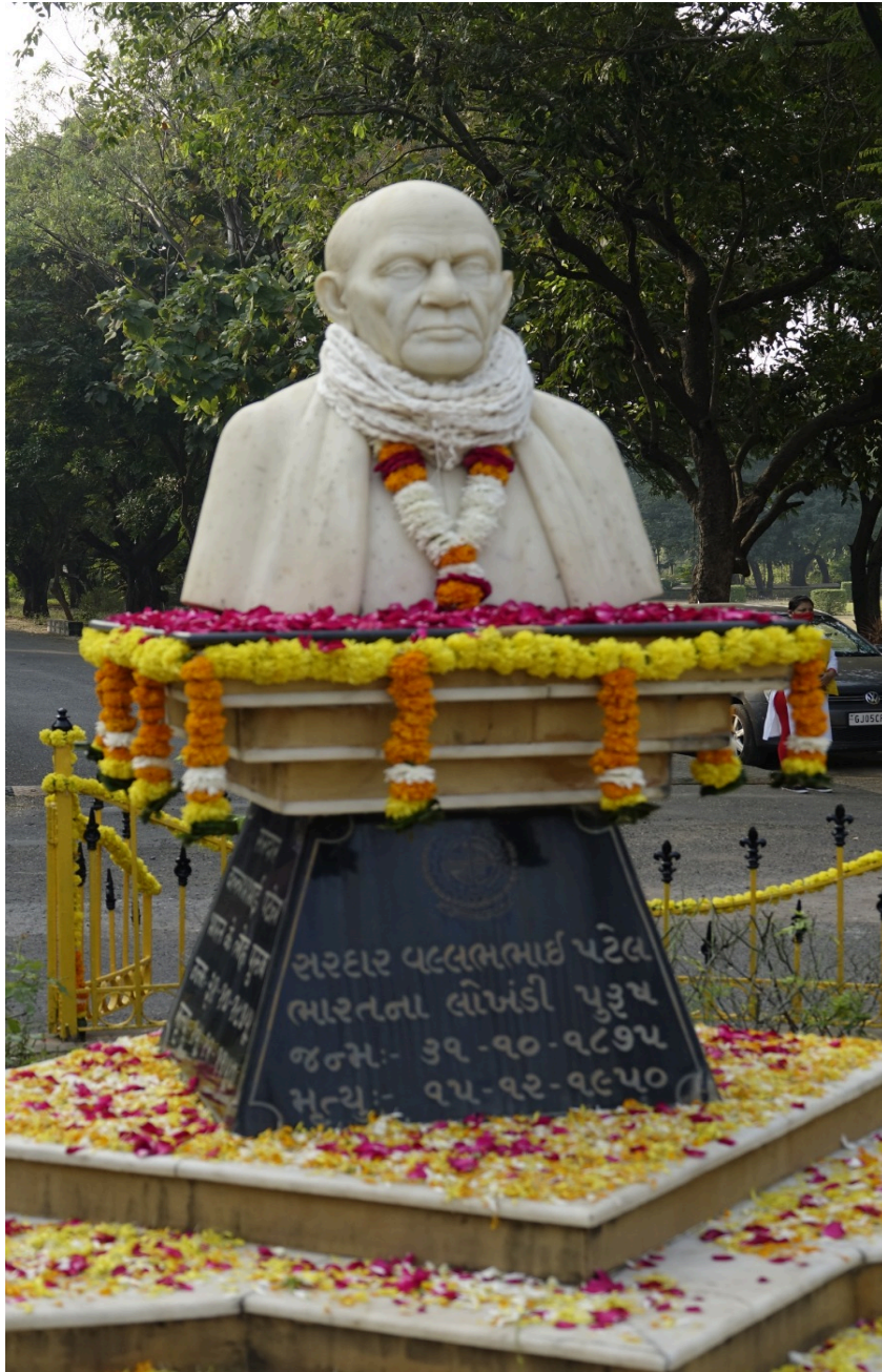
SARDAR VALLABHBHAI PATEL