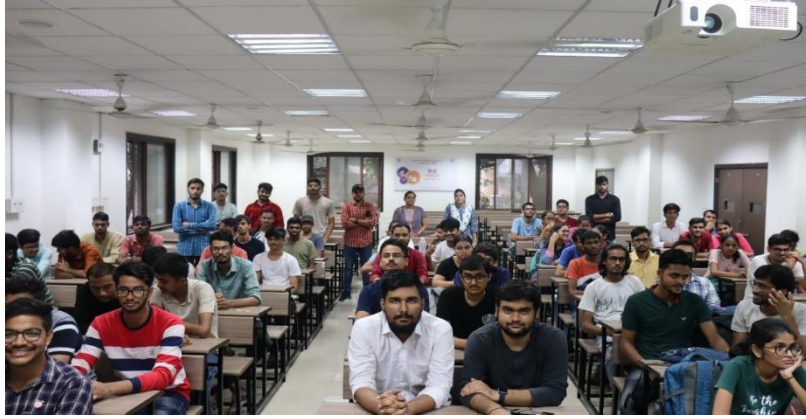
Organization of Hindi Quiz Competition for students during Hindi Fortnight-2023