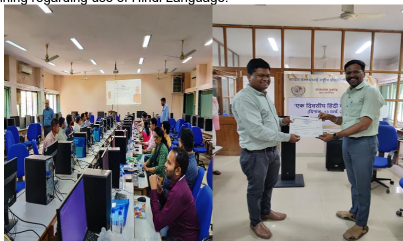
Hindi workshop organisation on 13 th March-2024