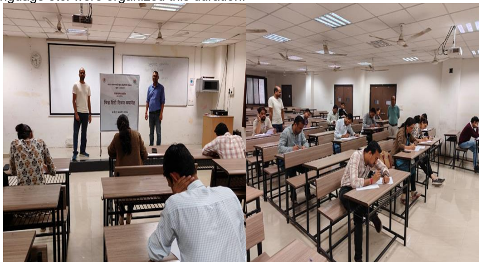
English Hindi Translation competition during World Hindi Day events on 11 th January-2024

In January, 2024, World Hindi Day event was organized by Hindi cell during 1-15 January, 2024. In this event many Hindi related programs and Hindi competitions were organized for employees and students of the Institute. Hindi quiz, Hindi paragraph writing and Hindi book exhibition English-Hindi translation competition and Hindi essay writing competition were organized. In February, 2024, International Native Language week was observed during 20-28th February 2024. Many events like Panel discussion in Hindi, Signature campaign in native language etc. were organized this duration.