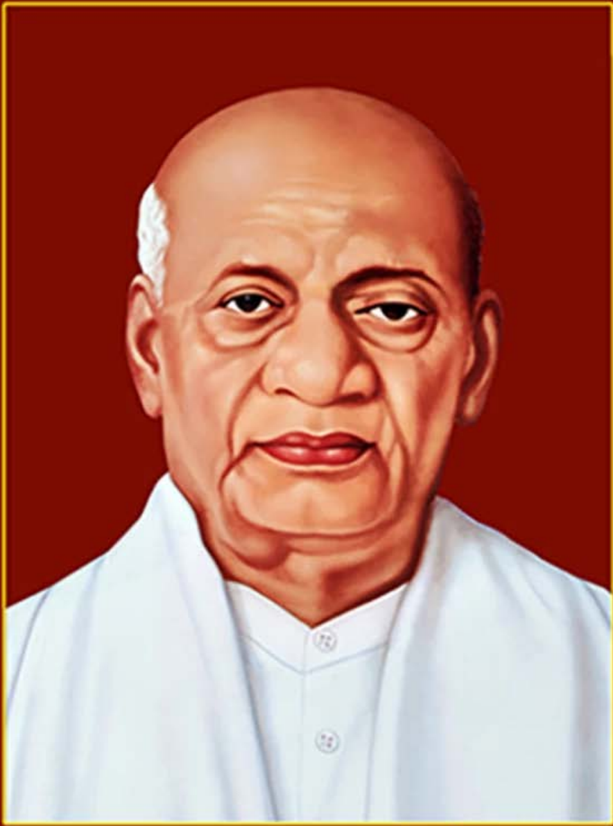
सरदार वल्लभभाई पटेल