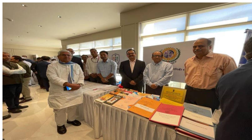
Parliamentary Committee for official language inspection visit January.2024